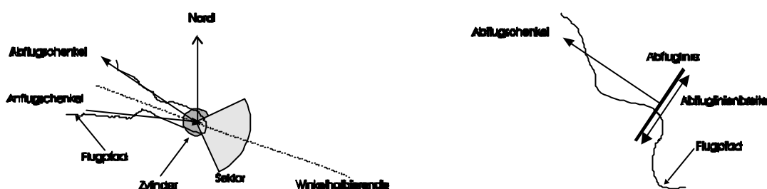
Figure 3: Observation Zone Sector/Cylinder/Start-/Finishgate